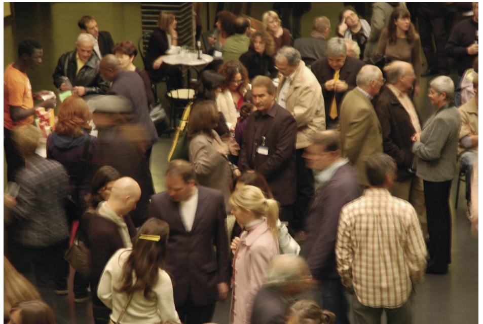
The PRIX EUROPA participants