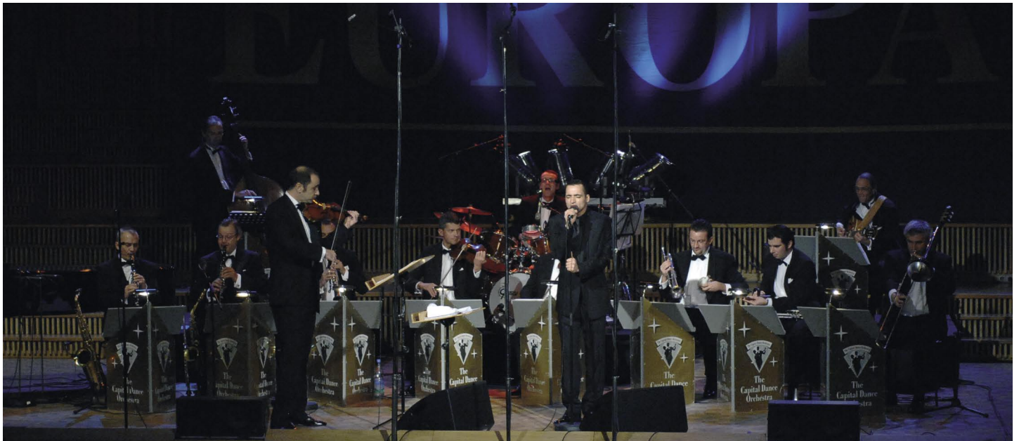
Muhabbet & The Capital Dance Orchestra at the opening concert of PRIX EUROPA and the Radio Day of European Cultures 2007

If you turn on the radio on Sunday 14 October anywhere in Europe, you are likely to come across a variety of programmes about European cultures. Over 40 radio stations from 30 European countries have joined the initiative of the European Broadcasting Union and PRIX EUROPA to make Europe audible with the aim of building bridges and bringing about a sense of European identity. Its motto 'My Europe' is reflecting individual rather than political or institutional perceptions of the continent. This specific theme was taken up, for example, by the Swiss Radio Rumantsch with a portrait 'My Europe is a pile of books'. On Slovak Radio Devín, the sought-after Slovak musician Oskar Rozsa presents Slovak music seen through his personal European spectacles. The Ukrainian Radio presents a programme 'My