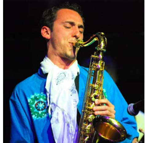
Photo OK Bio OK Date of birth 20.04.1981, Bucharest Demo OK Passport # 13395514 Postal Address Shackletonstraat 3-III 1056 RL Amsterdam Nederland Email Address simualex@yahoo.com Telephone +31643229432