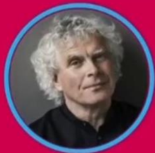
CHIEF CONDUCTOR OF THE BAVARIAN RADIO SYMPHONY ORCHESTRA AND CHOIR

“An orchestra should be part of the centre of society. We should be bringing people in and showing them that this music is life changing and giving them the opportunity to have their life changed.”