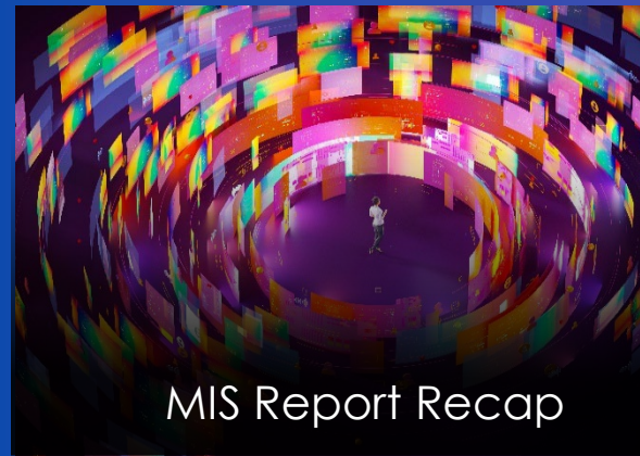
MIS Report Recap