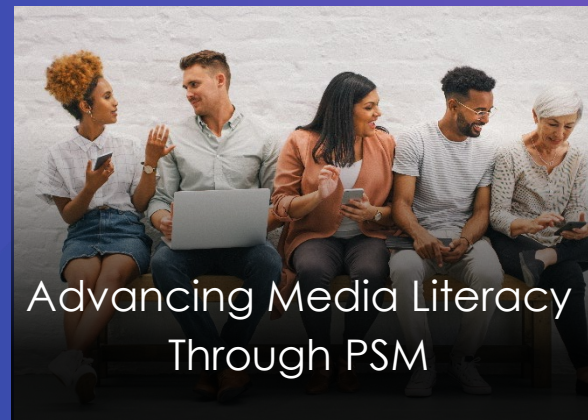
Advancing Media Literacy Through PSM