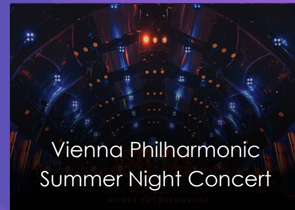
Vienna Philharmonic Summer Night Concert