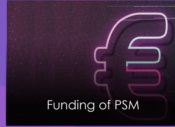
Funding of PSM