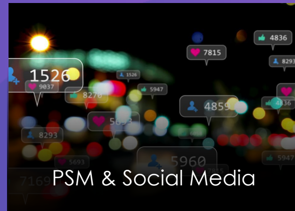
PSM & Social Media