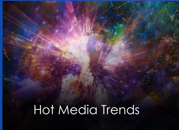
Hot Media Trends