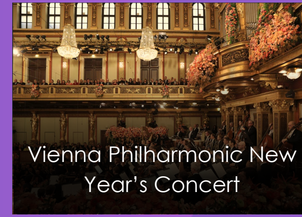
Vienna Philharmonic New Year's Concert