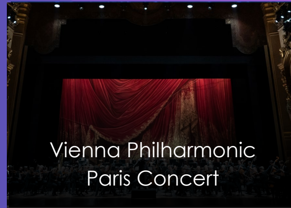
Vienna Philharmonic Paris Concert