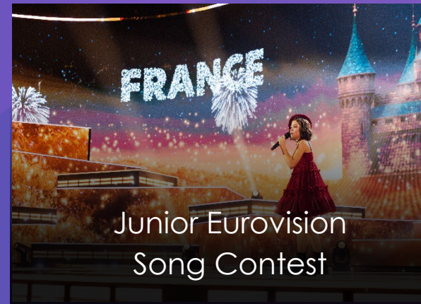
Junior Eurovision Song Contest