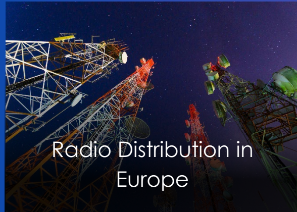
Radio Distribution in Europe