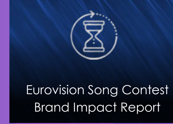
Eurovision Song Contest Brand Impact Report