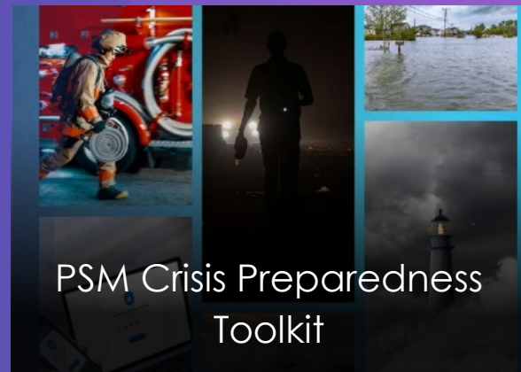
PSM Crisis Preparedness Toolkit