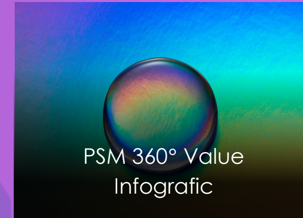
PSM 360° Value Infographic