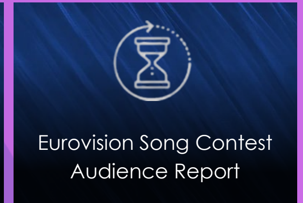
Eurovision Song Contest Audience Report